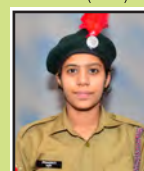
Prakriti Best Cadet (NCC Army Wing)