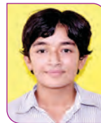
Samta 11th-A (Arts)