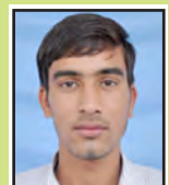
Ajay Boxing (Gold)