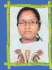
Neelam XI Med.