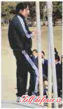
Self defence is Nature's oldest law