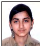
Jyoti Junior Wing