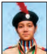
Misal Senior Wing